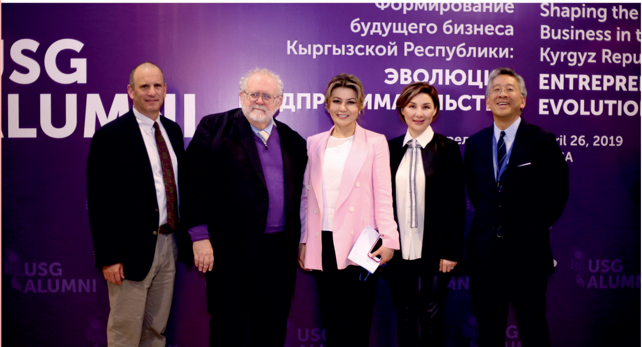
USG Alumni Reunion 2019

American Chamber of Commerce in the Kyrgyz Republic