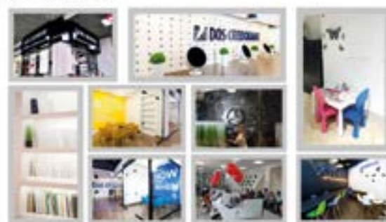
We are creating different spaces to make our clients feel comfortable