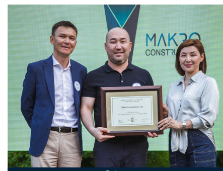
Welcome MAKRO CONSTRUCTION AmCham New Member