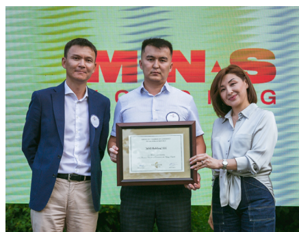
Welcome M·N·S HOLDING AmCham New Member