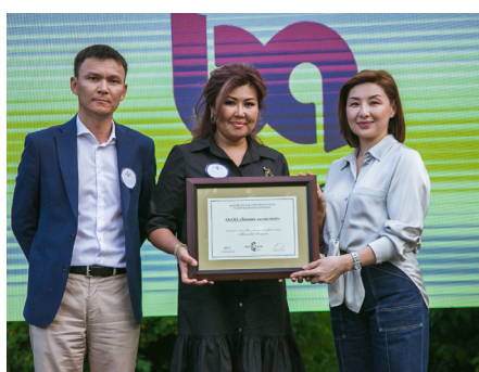
Welcome BUSINESS ASSISTANT AmCham New Member

AmCham expresses its gratitude to the mentors, mentees and partners of the project for their invaluable contribution, as well as to the US Embassy for their support!